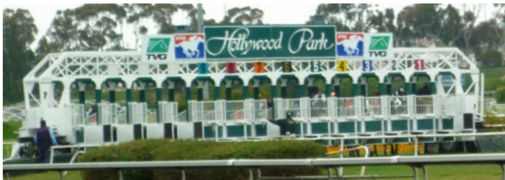
Picture from WIT-LA's 19th Annual Day at the Races at Hollywood Park, May 7, 2011.