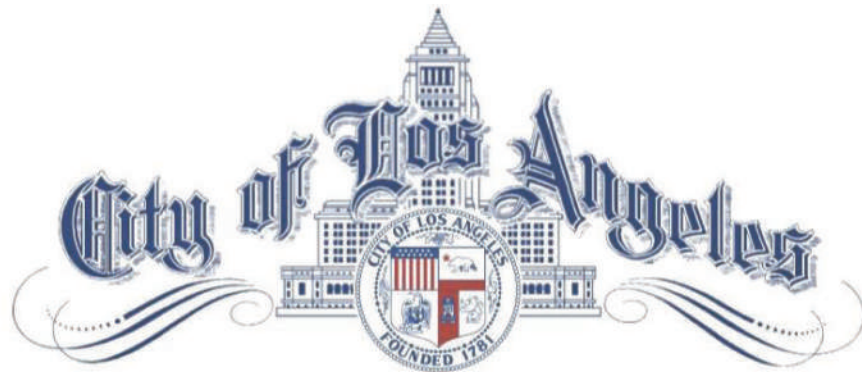
ERIC GARCETTI MAYOR