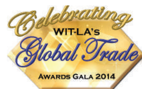
ERIC GARCETTI Mayor